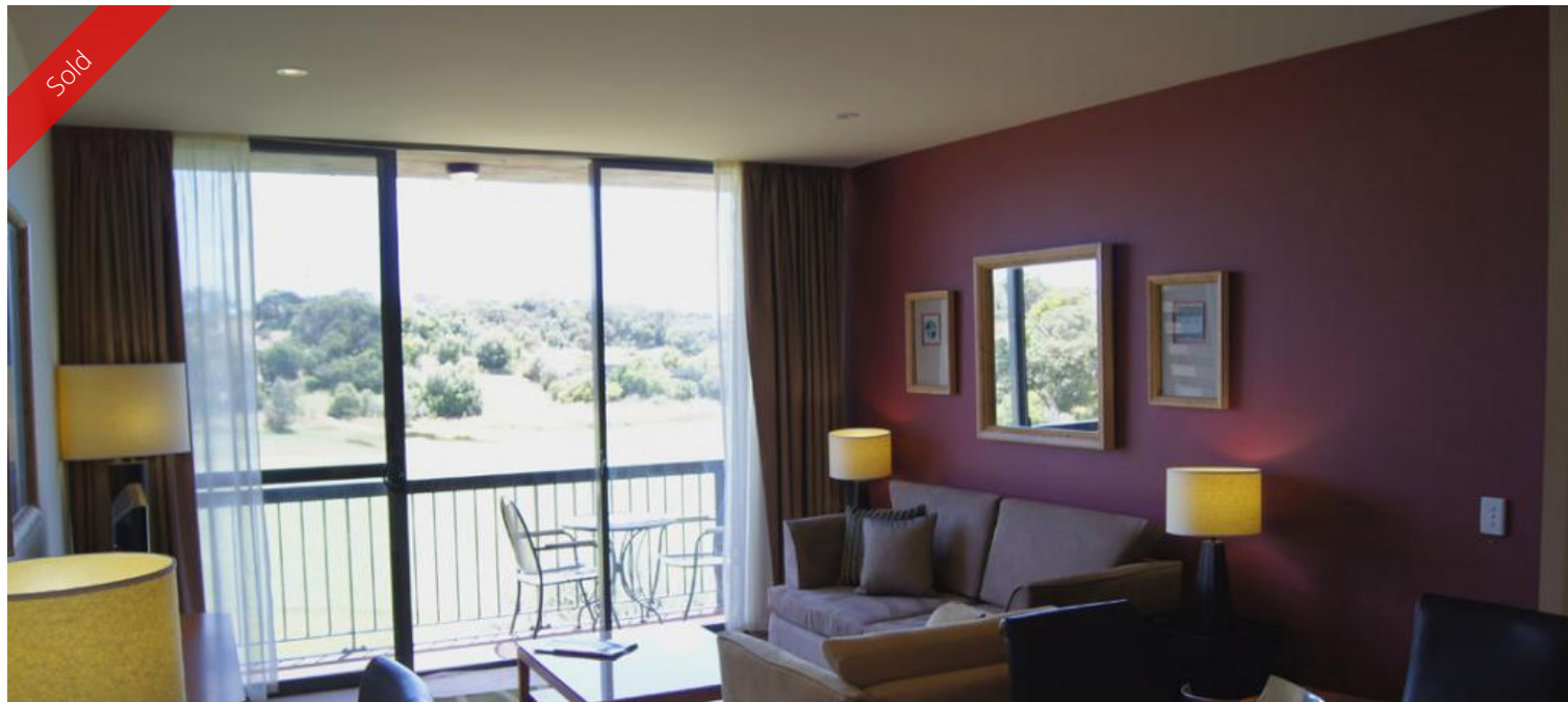
19 And 20 St Georges Terrace, Fingal