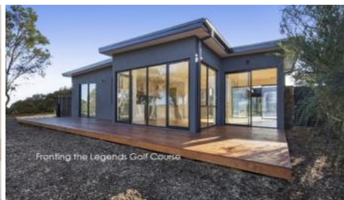
Fronting the Legends Golf Course