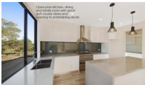
Open-plan kitchen, dining and family room with great golf course views and opening to entertaining decks