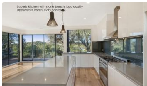
Superb kitchen with stone bench tops, quality appliances and butler's pantry