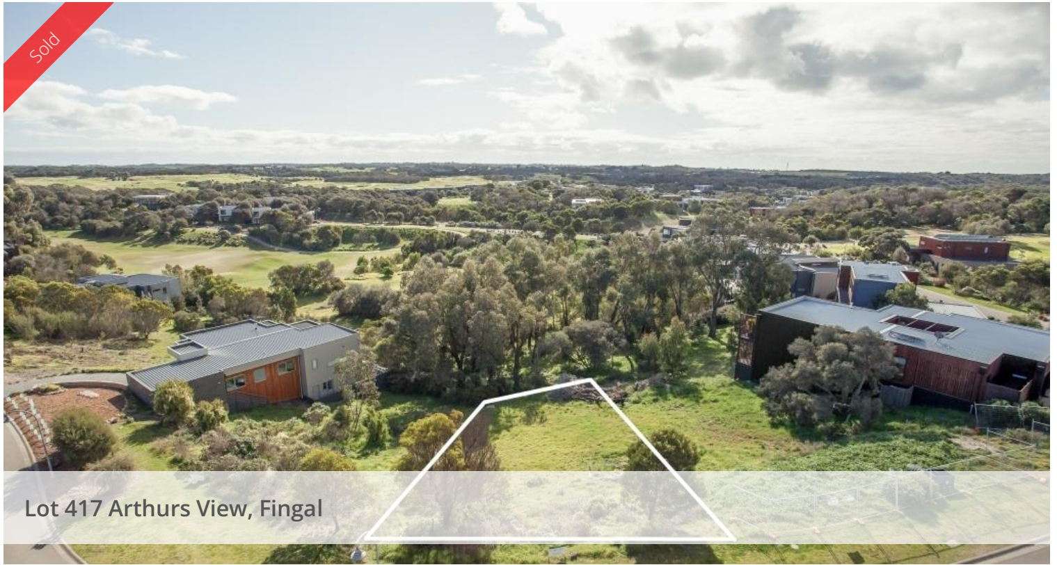
Lot 417 Arthurs View, Fingal