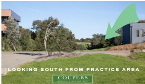
LOOKING SOUTH FROM PRACTICE AREA