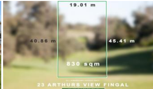
23 ARTHURS VIEW FINGAL