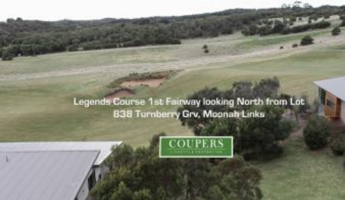
Legends Course 1st Fairway looking North from Lot 838 Turnberry Grv, Moonah Links