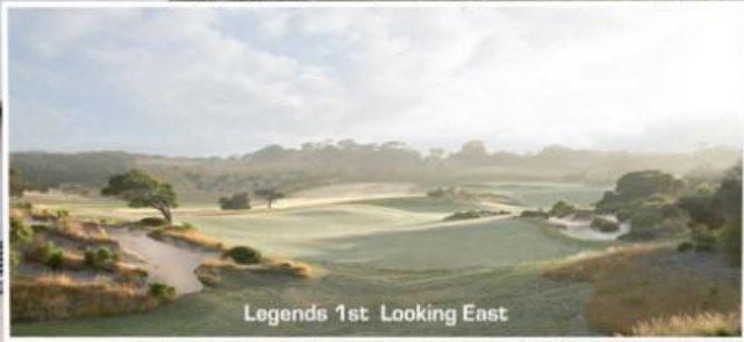
Legends 1st Looking East