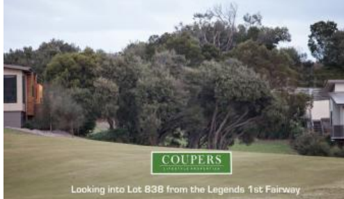
Looking into Lot 838 from the Legends 1st Fairway