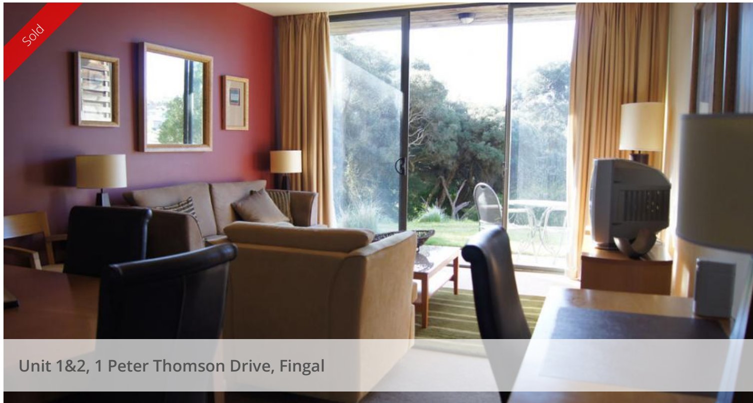
Unit 1&2, 1 Peter Thomson Drive, Fingal